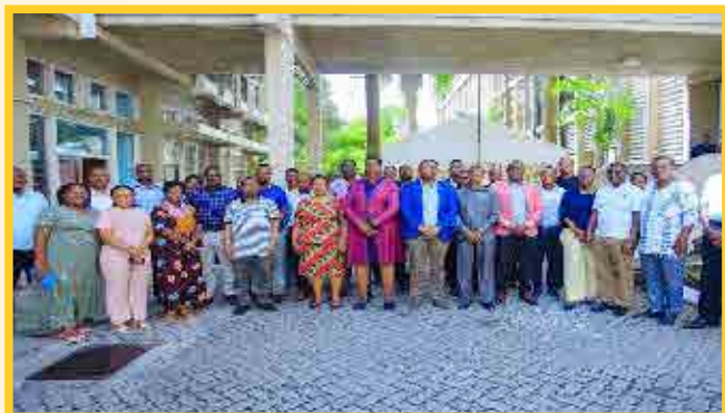
Photo: Stakeholders in Curriculum Review Validation Workshop, 27 th October 2023