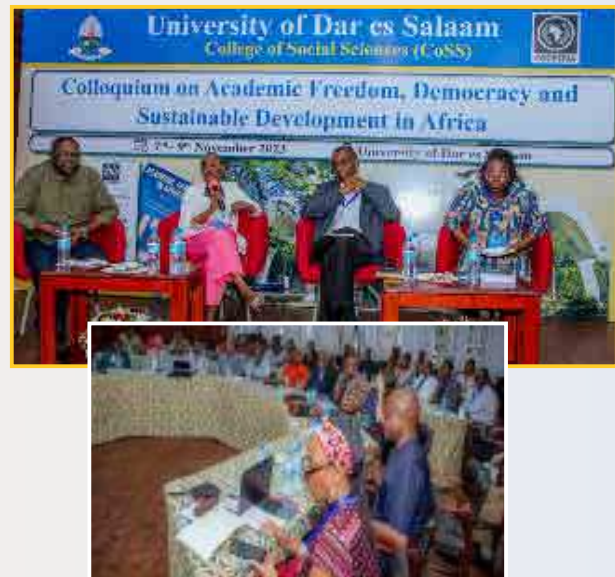
Photos: Some sections of the debates at Council Chamber

Earlier in the year, our CoSS seminar series featured debates about academic freedom and social responsibility of academics, which was not an easy space to navigate given what can now be understood as the impact of years of de-intellectualization of the Hill. Allow me to situate the recent CoSS-CODESRIA colloquium within the College's broad commitments towards rejuvenating the spirit of the Dar es Salaam School of thought. We are promoting transformative intellectual engagements critical to attaining national, regional and global visions for a better society and sustainable development. The theme of the three days colloquium (7-9 November 2023) was “Academic Freedom, Democracy and Sustainable Development in Africa: Re-envisioning the role of the University in East Africa” , which is reflective of our ambitions.