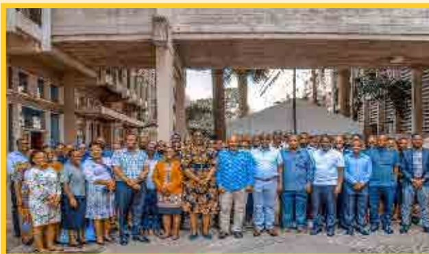
Photo: Stakeholders in Tracer Study Validation Workshop, 27 th May 2023

As other University units, CoSS participated in the tracer study exercise as an important entry into curriculum review. Thanks to our graduates (employed, self-employed and unemployed) who were sincere in informing us about the weak and strong points of our programs. We appreciate and value their views. Few of them joined us in validating the tracer study report on 27 th May 2023. Later in October, they joined us again in validating curriculums that we worked on reviewing for the rest of the year.